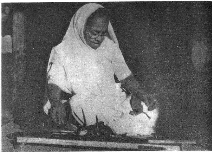
Kasturba spinning a charkha at the age of 69, Sevagram

Sarojini Naidu described her as "the living symbol of Indian womanhood. Never once did her feet falter or her heart quail on the steep path of perpetual sacrifice which was her portion in the wake of the great man whom she loved and served and followed with such surpassing courage, faith and devotion. She has passed from mortality to immortality and taken her rightful place in the valiant assembly of the beloved heroines of India's legend, history and song".