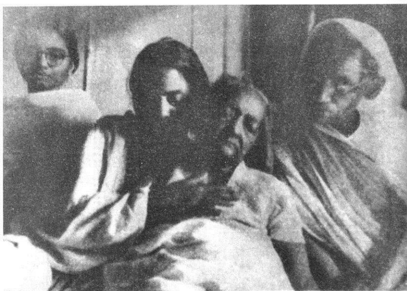
Last Moment of Kasturba, Aga Khan Palace, Pune