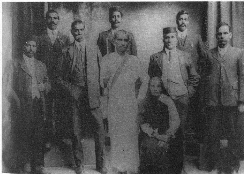
M. K. Gandhi with Kasturba and others at the end of the struggle in Johannesburg, 1914